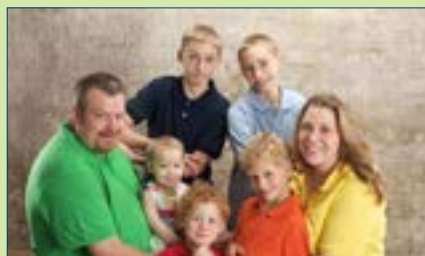
A family of five had their house flooded and are in need of assistance.

family that has been flooded out in Pacific Junction. Not only have we partnered with IDW Disaster Relief to help with their housing, but we are also gathering gift cards to Walmart, HyVee and Fareway to assist with food.