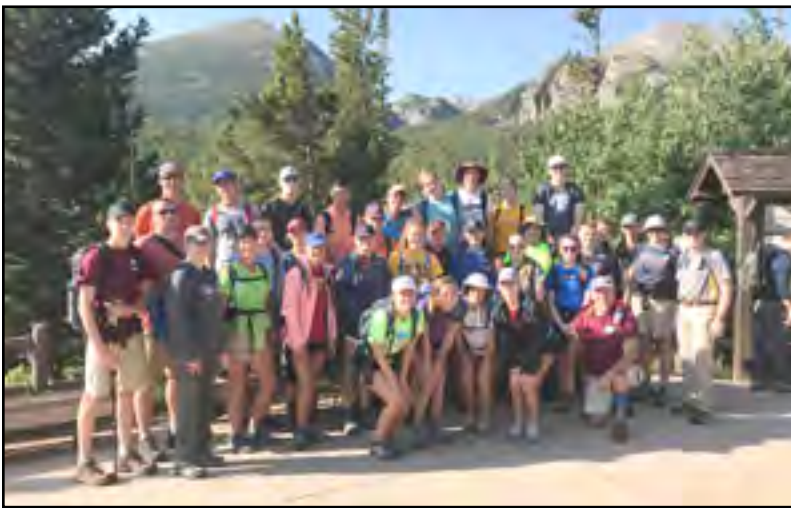
The Wandering Team of 2018

“Wow! Our God is GOOD!” What an awesome trip we just experienced with 24 teens and 8 adults, who ventured off to destinations unknown to the teens. Each day during the trip, the teens were encouraged to dive into God’s Word, write in their devotion/journal books, help in daily chores and worship together in a group.