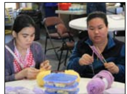
The children and women at Laurel Village enjoy learning new skills.